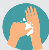
FOCUS ON THUMBS