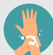
FOCUS ON WRISTS