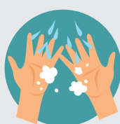
WATER AND SOAP