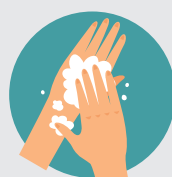
BACK OF HANDS